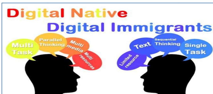
FIGURE (1) http://thesocialmediatraineec.wordpress.com/2010/05/09/digital-natives-vs-digital-immigrants/

the framework of the digital rise. The first mindset, called Mindset 1, assumes the digital revolution is just an extension of the industrial revolution. On the other hand, Mindset 2 assumes the world is now totally different from the way it was 30 years ago in terms of thinking and doing. Teachers with Mindset 1 believe there is no urgent need for a change of the educational model and they resist change. Teachers might think they do not need to change, as they succeeded without the digital tools. Change might be more difficult for teachers living or teaching where the digital development has just started to emerge, such as developing countries.